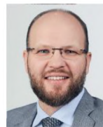
JĀNIS TAUKAČS Baltic States