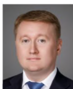
IGOR SMIRNOV Russia